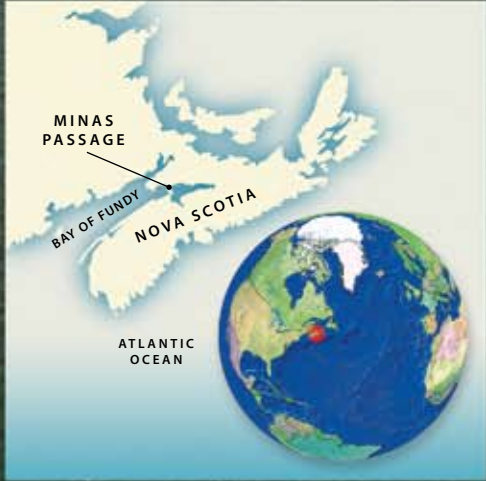
Above (and inset): North America's first commercial scale turbine is towed into position at the FORCE test site (map, right) in the Bay of Fundy (November 12, 2009).

The FORCE test site is considered ideal for in-stream tidal devices, with an enormous tidal resource close to the existing electricity grid.