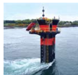
Minas Basin Pulp and Power's technology partner is Marine Current Turbines.

In the Minas Passage alone, EPRI estimated a nearly 300 megawatt potential (equal to enough power for about 100,000 homes). Some estimates put the resource potential in the Bay of Fundy as high as 8,000 megawatts.