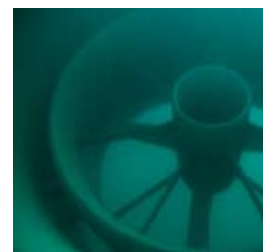
ALSTOM's technology is Clean Current.