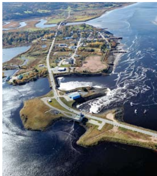
North America's first and only tidal generating station in Annapolis Royal, Nova Scotia.

If you can produce power under those conditions, and produce it safely and reliably, you can meet the Fundy Standard.