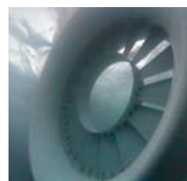
Nova Scotia Power's technology partner is OpenHydro.